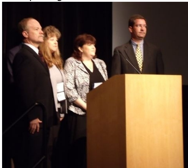
The quartet just prior to the National Anthem