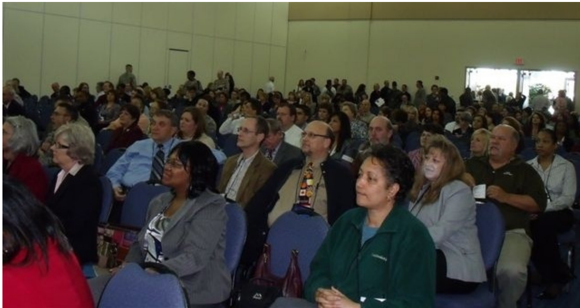
Participants enjoy the opening session

A banner welcomes participants to the Emerald Coast Conference Center